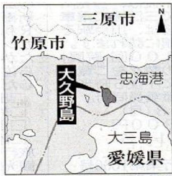
Map Island Ookuno, covered by Mihara, Takehara, Ehime