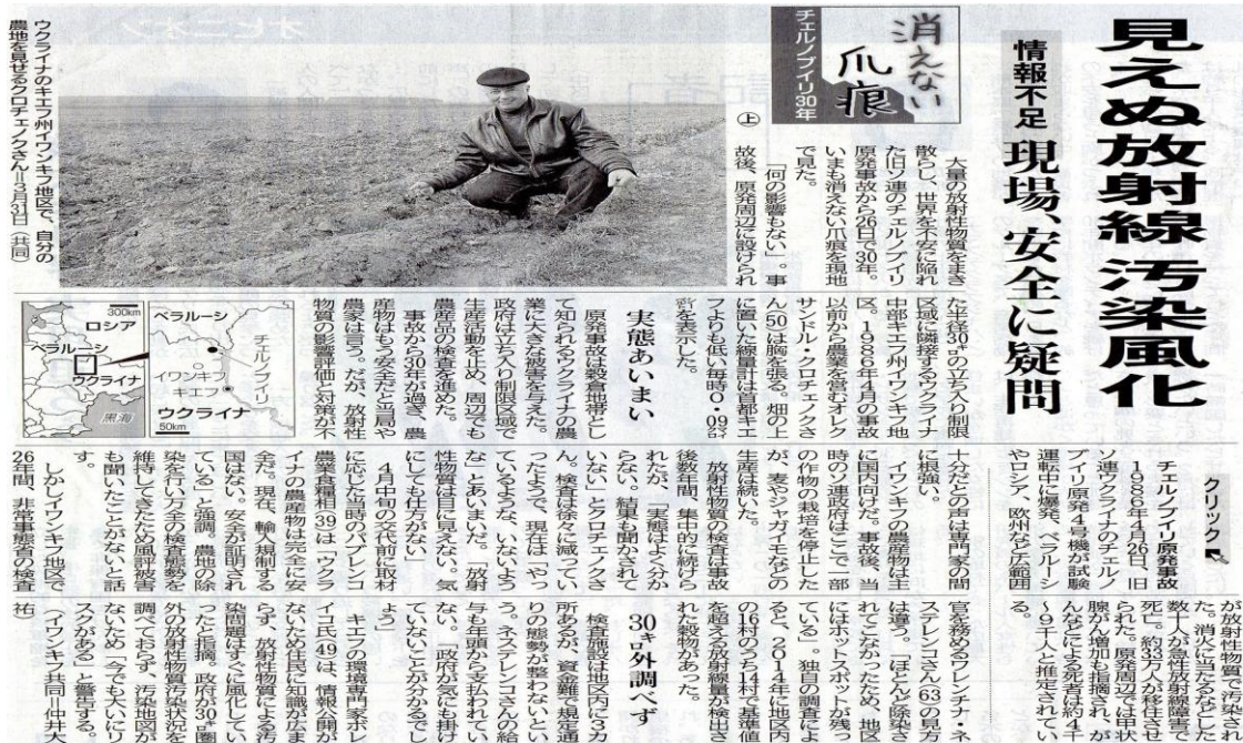
Above: Chernobyl 30 years safety question damages, Ukraine. Below, from right to left: Philip Hammond, Secretary of State for Defence, the UK; John Forbes Kerry, United States Secretary of State; and Fumio Kishida, Hiroshima Councilor.