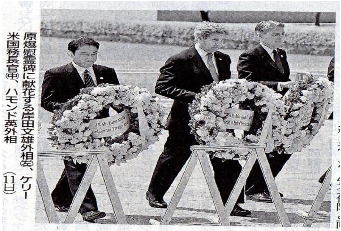
Hiroshima Peace Park on 11 April, Chugoku Newspaper