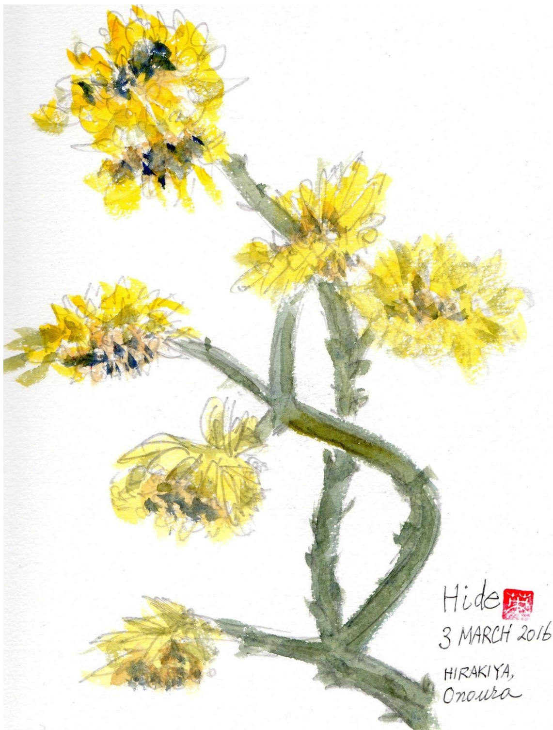
Three stems, at their best by Hide, in 2016