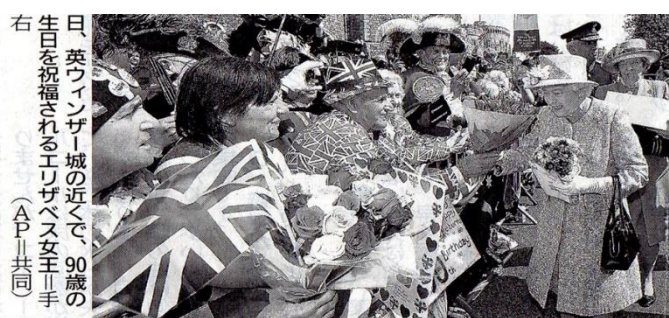
右 日英ウィンザー城の近くで、90歳の生日を祝福されるエリザベス女王（手前）