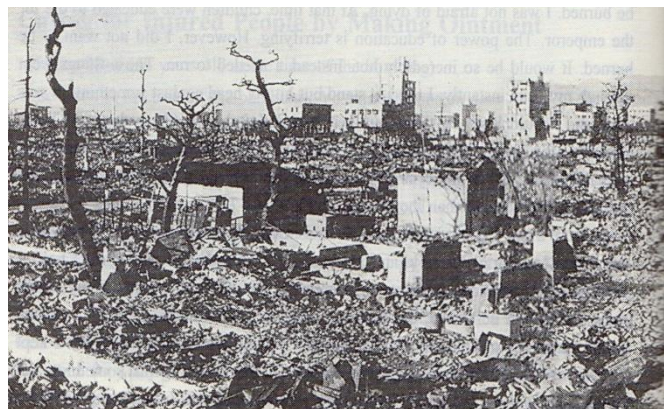
The photo is a view of the center of Hiroshima from the Kyo-Bridge that was 1.4 km northeast from the hypocenter. (Nov, 1945)