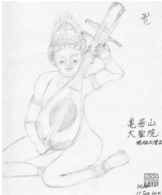
Benzaiten in Temple Daisho-In

密教・灌頂・聖句・誦持・明呪・次第・実践修行・一文・大日如来・功德・受持風誦・重罪・宿業・病障・弁才・福楽・長寿・土砂・加持・死者・散ずる・亡者・得脱・罪障・消滅・西方・安楽・国土・往生・伝承